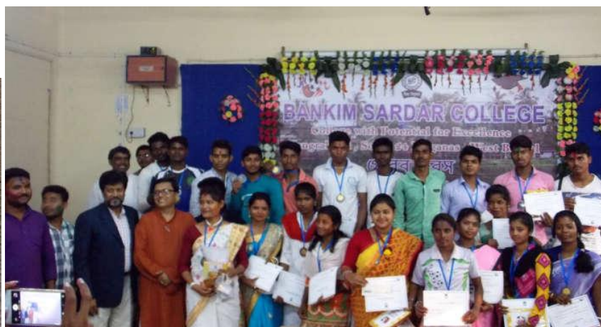
Principal sharing moments with the Kriragourabs