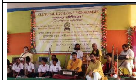
Boy students David Sassoon High School (Canning) participating in the Cultural Exchange Programme