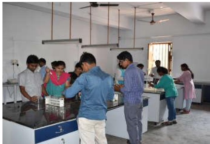
Bio chemistry laboratory

With concomitant change of syllabus in Botany and Zoology the necessity of biochemistry lab was felt by both the departments. In view of this the college established a biochemistry lab to be used by both departments separately.