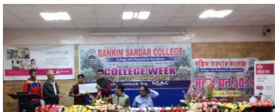
Principal awarding Attendance Scholarship to students having more than 75 % class attendance