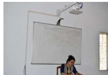
Virtual Classroom 2017

Virtual classroom technology for off campus interactions