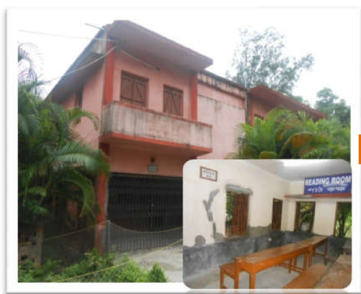
The Old Library and the old Reading Room

The age old college library building is in very bad shape showing cracks and fissures and thus do not have any future beyond three to five years. Also the present library is not large enough to accommodate new books and journals and the reading room space is also highly inadequate. The ambiance of the existing reading is very much repelling and do not encourage reading habits for the students and the teachers.