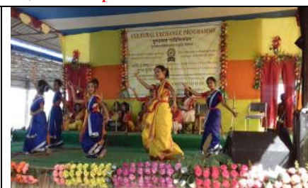
Girl students Taldi High School (Canning) participating in the Cultural Exchange Programme