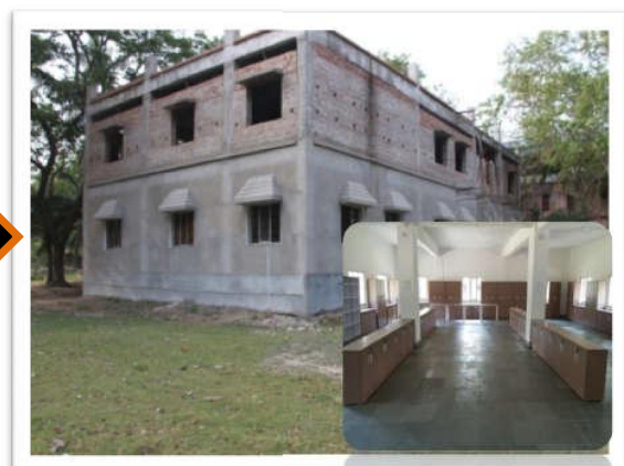
The newly constructed Library and the new Reading Room

The college has utilized the RUSA (new construction) fund towards construction of a two storied building (totalling an areas of 10000 sq ft).