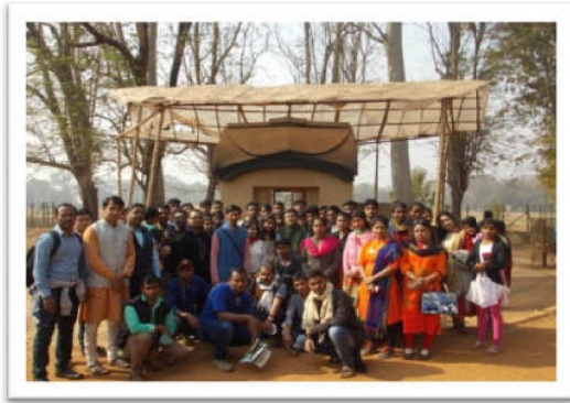
34 students and 12 mentors visited Santiniketan on Feb 2, 3