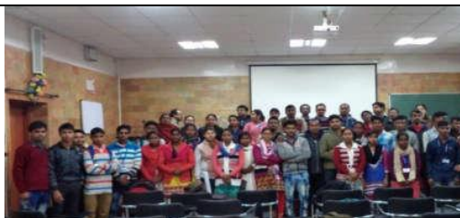
Winners and Runners-up in College week along with their Mentors