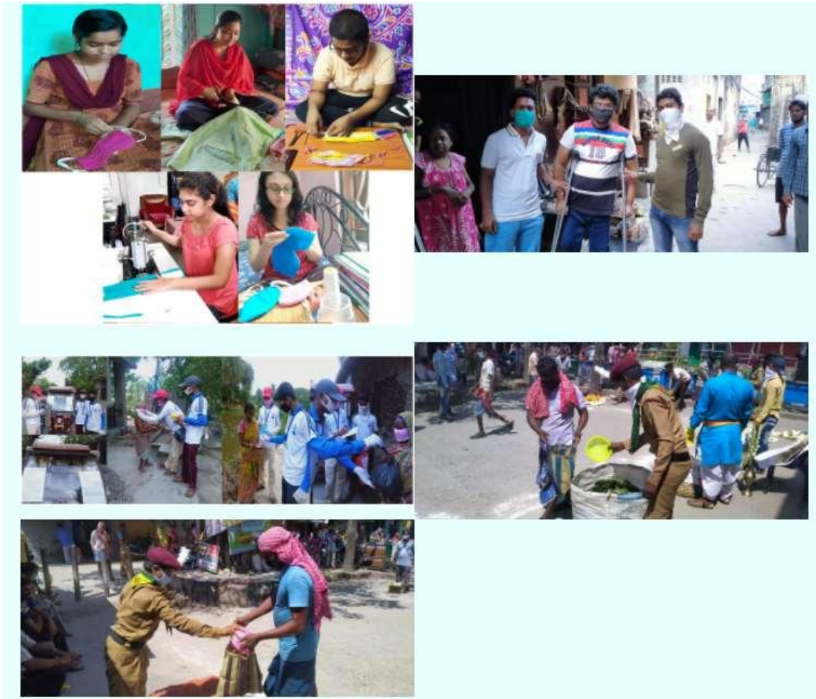
Institutional Social Responsibilities During Pandemic