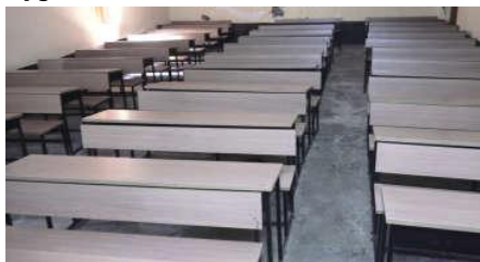
Upgraded classroom 2017

Towards better learning ambience in the classrooms