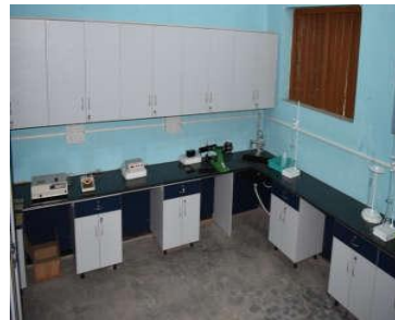
Physical Chemistry laboratory

The Physical Chemistry Lab, a new venture of the Department of Chemistry, looks forward to explore new ideas in this area of scientific inquiry. It is also enriched with modern equipments for better experimentation.