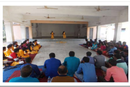
Santiniketan and Bankim Sardar College in cultural exchange