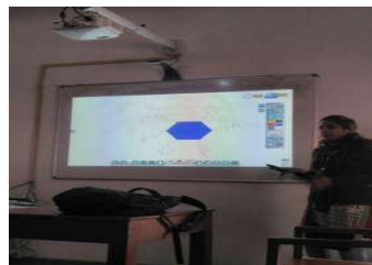
Smart Class room 2018

Smart classroom technology in the traditional classrooms.