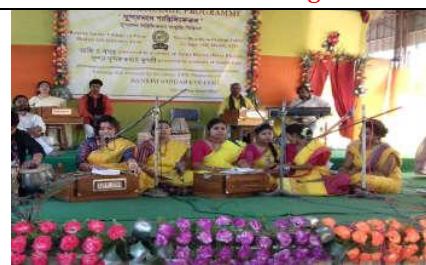
Students and Teachers from Bankim Sardar College singing songs of the Sunderbans