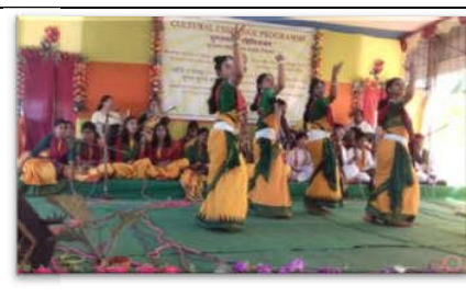
34 school students and 11 teachers visited Bankim Sardar College on March 18, 19 and performed Vasontoutsav