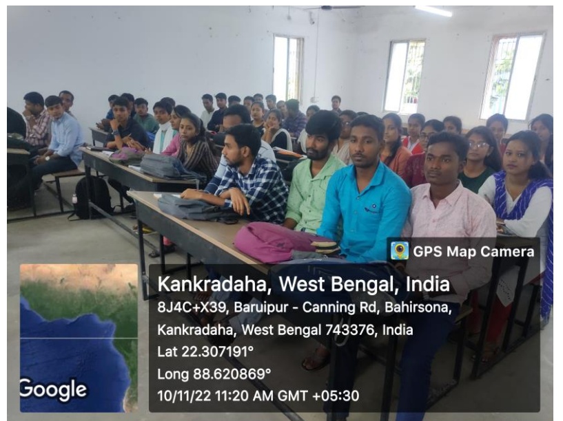
Batch – 2 of YEP