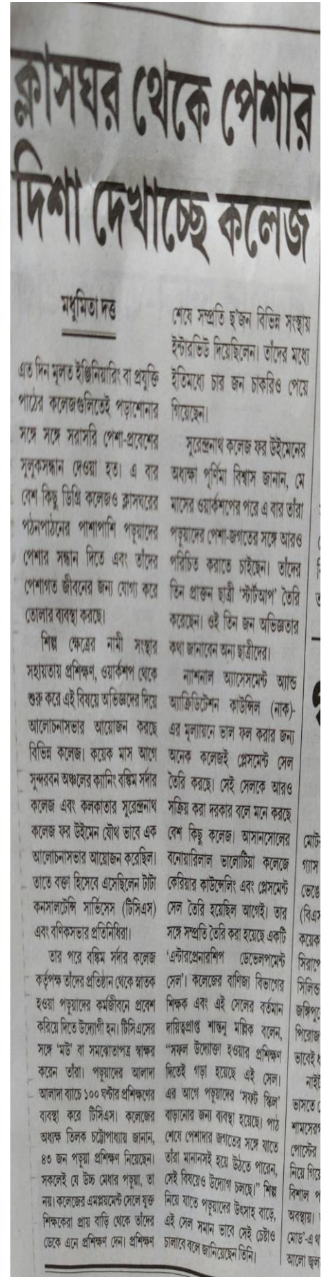
FEW MOMENTS FROM BATCH 1 & MEDIA REPORT ON BATCH 1 OF YEP